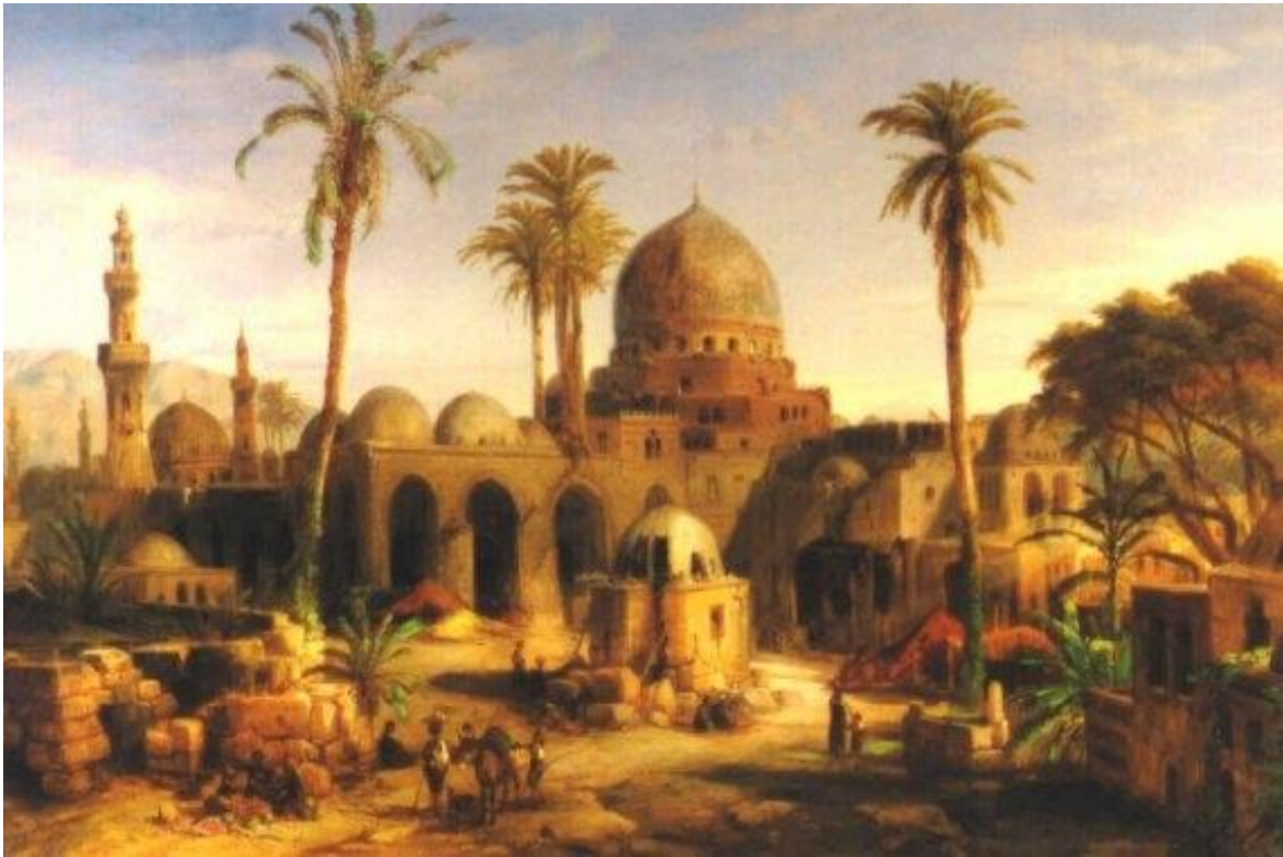
The mosque of Muhammad in Yathrib, later named Madina

The first thing Muhammad did in Yathrib, after building his mosque, was to issue an edict declaring himself to be the highest authority to whom everyone, including the Jews, had to submit. He also changed the name of the city to Madinat al Nabi (Prophet's Town), abbreviated to Madina.