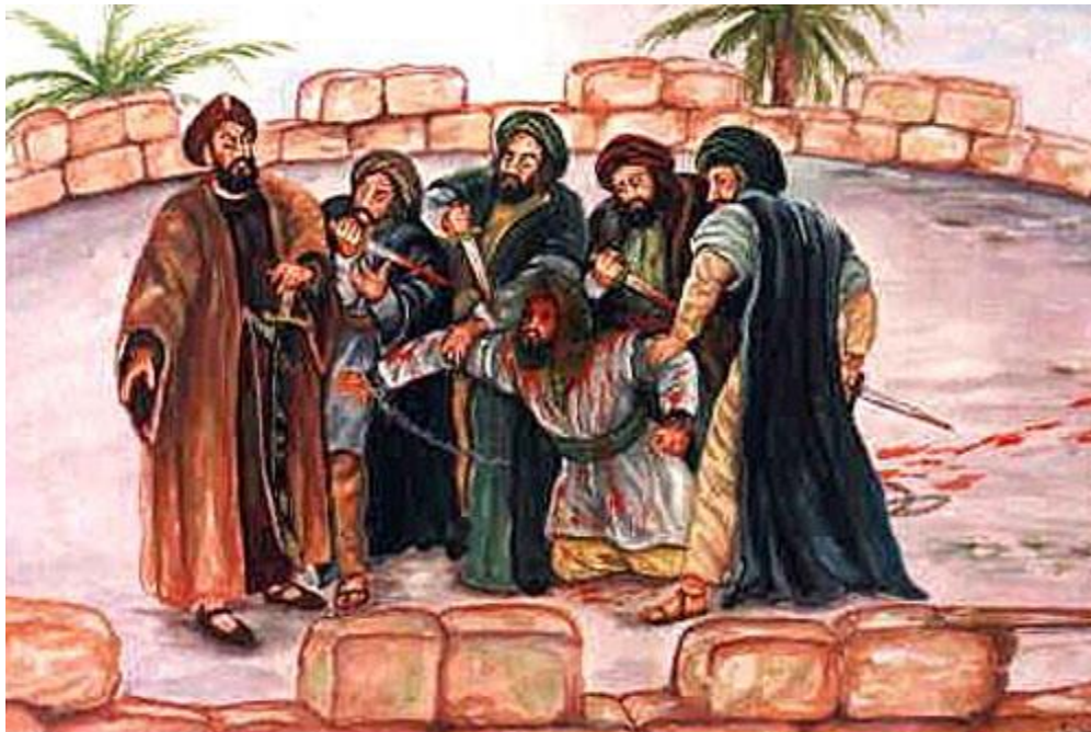
Muhammad's critics were assassinated

Muhammad taught his followers that the blood of unbelievers was like the blood of a dog, even if they are their father or brother. 35 He believed that victory was in terror, 36 and vowed to cast terror in the hearts of unbelievers. 37 He said “I have been made victorious with terror.” 38