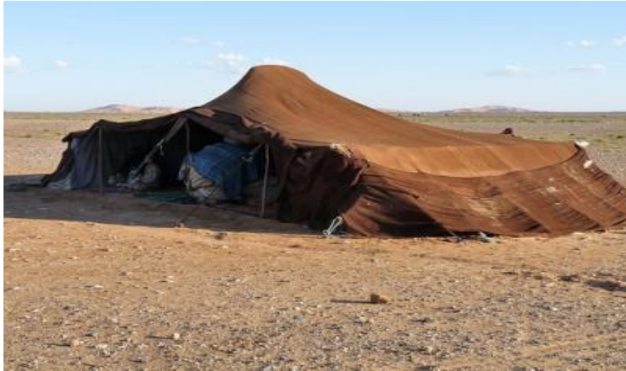
A Bedouin tent

As Muhammad grew, he became aware of his status as an orphan. He could see other children had parents who loved them while he did not have a father and his mother did not want him. He withdrew from others and acted so strangely that his foster parents were concerned. He reported hallucinatory experiences in which two men opened his chest and performed some kind of operation on him. Thinking that he had become demon-possessed his foster parents returned him to his mother.