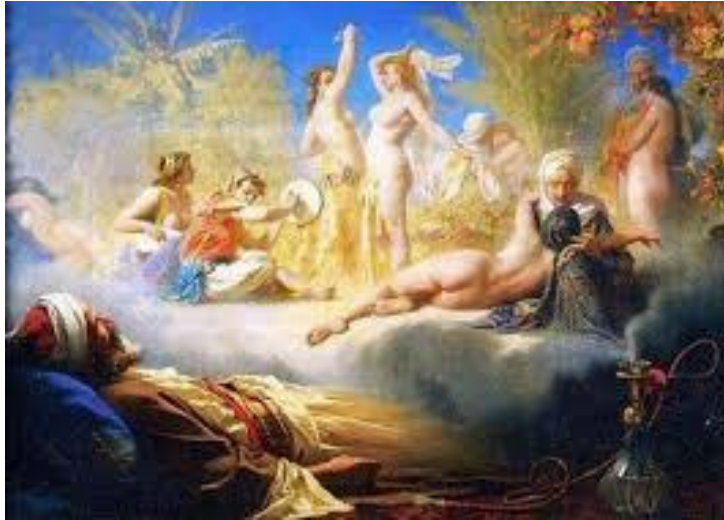
Artist's rendition of Islamic Paradise

Muhammad sent Musab, one of his followers, to accompany the new converts to Yathrib and to promote Islam in that town. Yathrib was a Jewish town. The Arabs in that city were relatively new. They had come as refugees from Yemen after a flood had destroyed their houses. When Musab's mother tried to stop her son, he told her that if she attempted to prevent him he would kill her. 28 Musab preached Islam to the Arabs in Yathrib secretly until about 90 people converted. They came to Mecca pretending to have come for pilgrimage where they met with Muhammad secretly at night. Muhammad repeated that if they obey him and fight for him, they will be wealthy in this world and will inherit Paradise if they die.