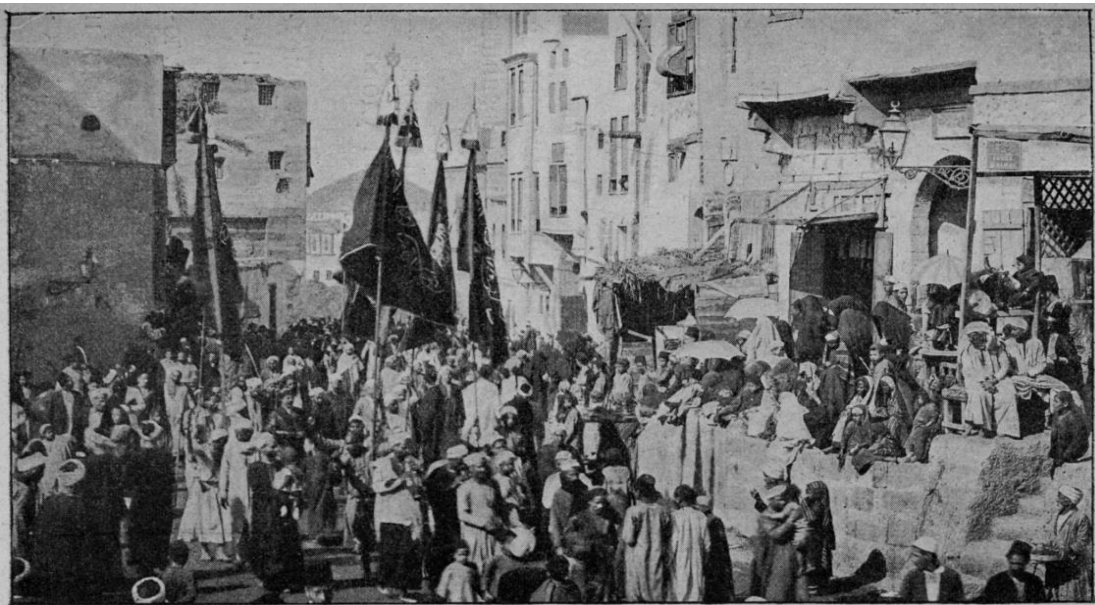
Streets of Mecca in the mid-20 th century

Arabs, prior to Islam, were monotheists, not idolaters, as many erroneously believe. They also believed in minor deities whom they thought acted as intercessors between them and their god. 3