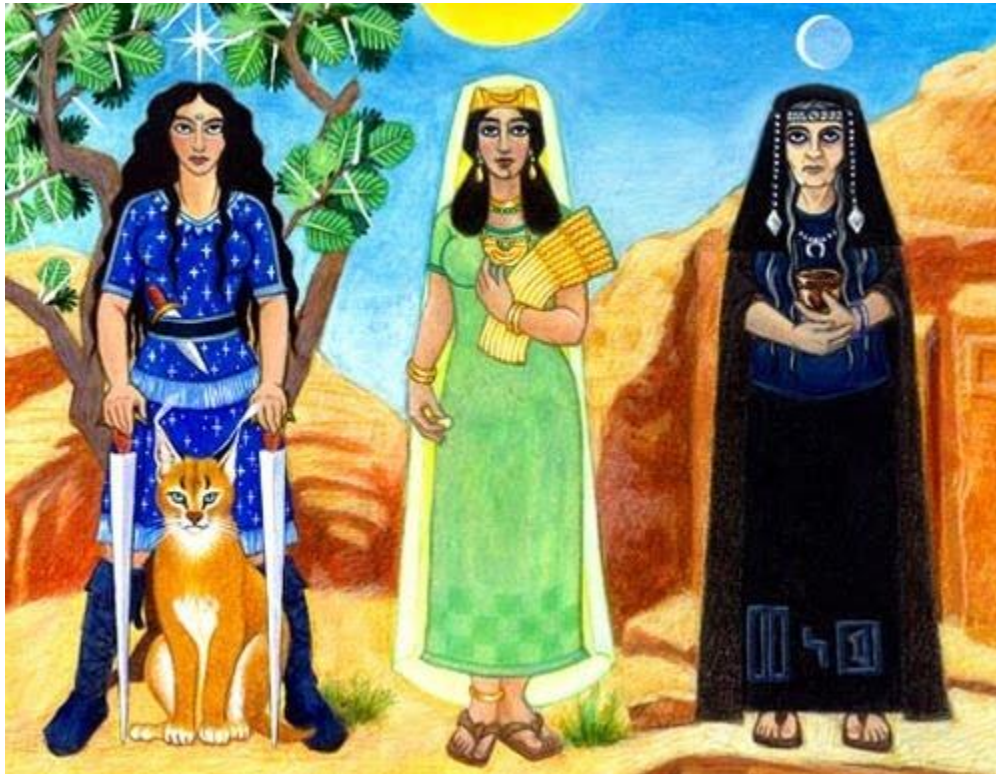
Uzza, Lat and Manat, the three daughters of Allah Hubaal

there would be peace. When this news reached Abyssinia, the Muslims rejoiced and many returned to Mecca.