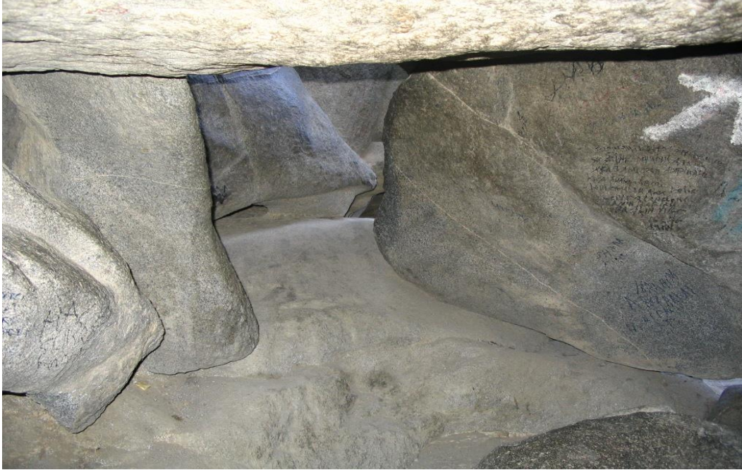
Inside Cave Hira

After some time, Zayd left Mecca for good, but Muhammad would continue going to that cave and staying alone. There is no indication that, after marrying Khadija he ever travelled to Syria or any other place for trading.