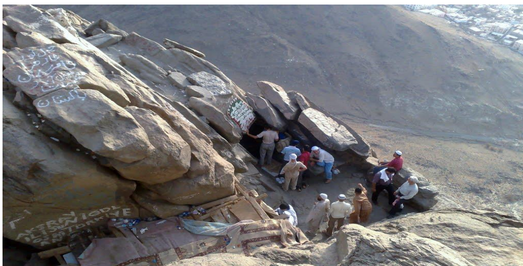
Cave Hira overlooking Mecca

Leaving his wife and his six children at home, Muhammad would pack provisions for several days and head to a cave called Hira on a mountain towering over Mecca. He was not alone in that cave. There was also a man called Zayd ibn Amr who converted to the Abrahamic faith and believed worshipping other gods beside God was idolatry. He began insulting the religion of the Quraysh until his brother kicked him out of the town and he took refuge in Hira. When Muhammad joined him, Zayd read stories from the Bible, which Muhammad found fascinating. 5