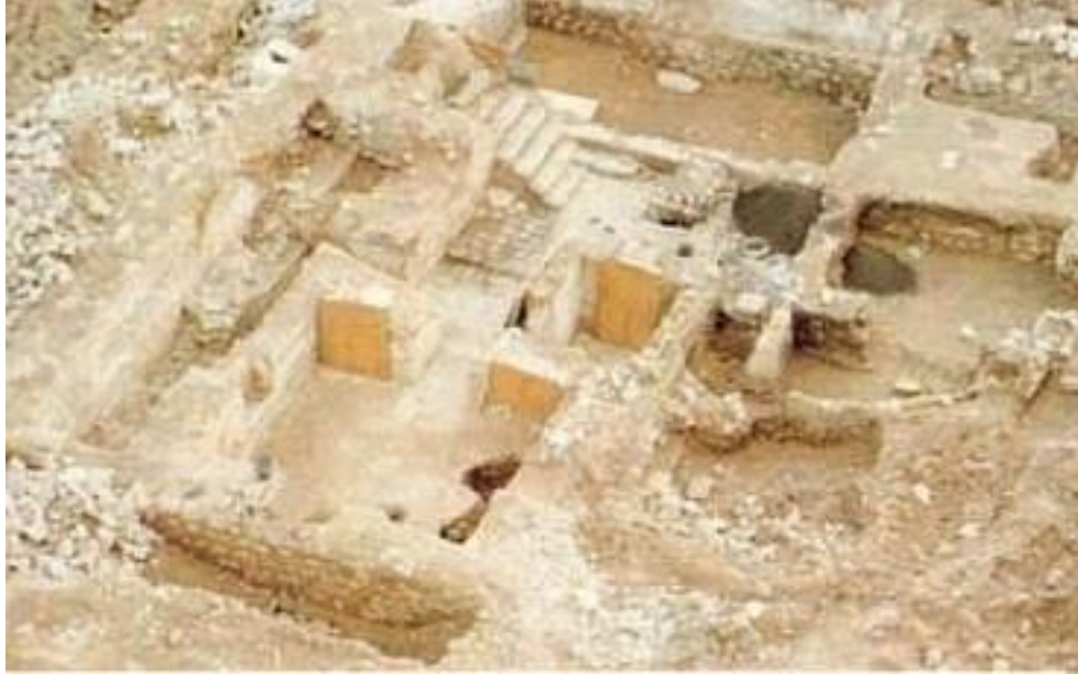
Ruins of the house of Khadijah was left abandoned and eventually erased by the Saudi government and a public toilet is built in its place.

In the winter of 620 A.D. Muhammad lost two of his staunch supporters. First his uncle, then his wife Khadija passed away. Three days after the death of Khadija, he asked his friend Abu Bakr to wed to him his six year old daughter. He said that she had been shown to him in a dream. She had been wrapped in a piece of silken cloth carried by an angel who said to him, “this is your wife.” When he uncovered her, lo and behold it was the six year old Aisha. 17 Abu Bakr who believed Muhammad to be a prophet of God agreed, but begged him to wait a few years until she had become a little older. Muhammad waited three years. 18 Meanwhile, he married Sauda, a young woman who, along with her husband, had migrated to Abyssinia where he and another Muslim converted to Christianity. Soon after their conversion they were reported dead.